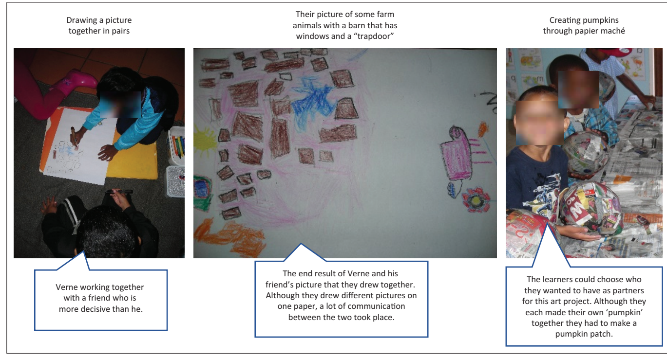
FIGURE 3: Verne became a more relaxed and happy learner.