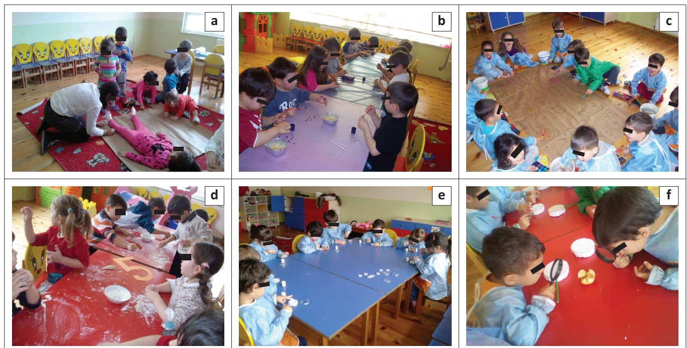
FIGURE 1: Some sections from the kneading and paper or collage works of the modular art education programme applied to children.

The data collected from the control and experimental groups were analysed using SPSS 15. As the data were normally distributed, parametric tests, the independent samples t -test, the Kruskal–Wallis test and one-way analysis of variance were performed. Frequencies and percentages were also interpreted.